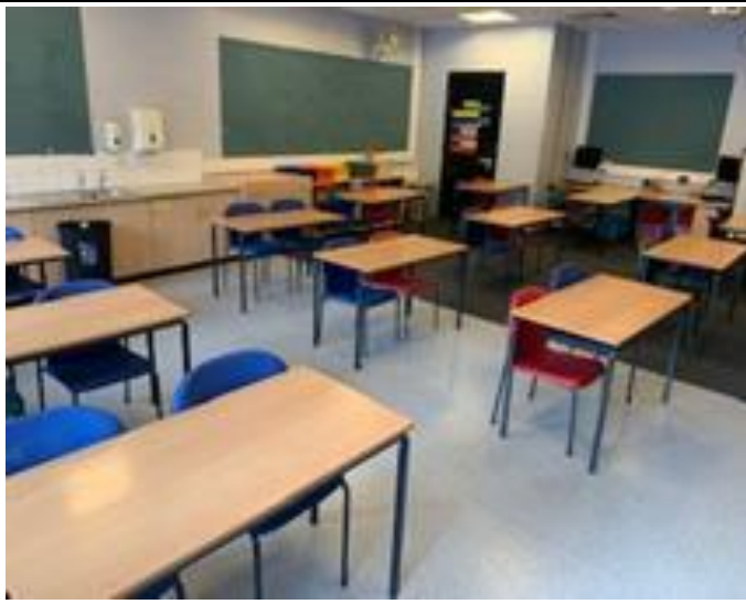
Layout of classrooms (EY/KS1/KS2)