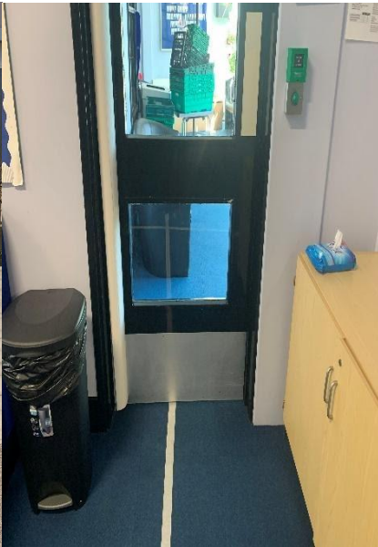
Promoting social distancing in the office and hygiene Area: Reception area including signing in